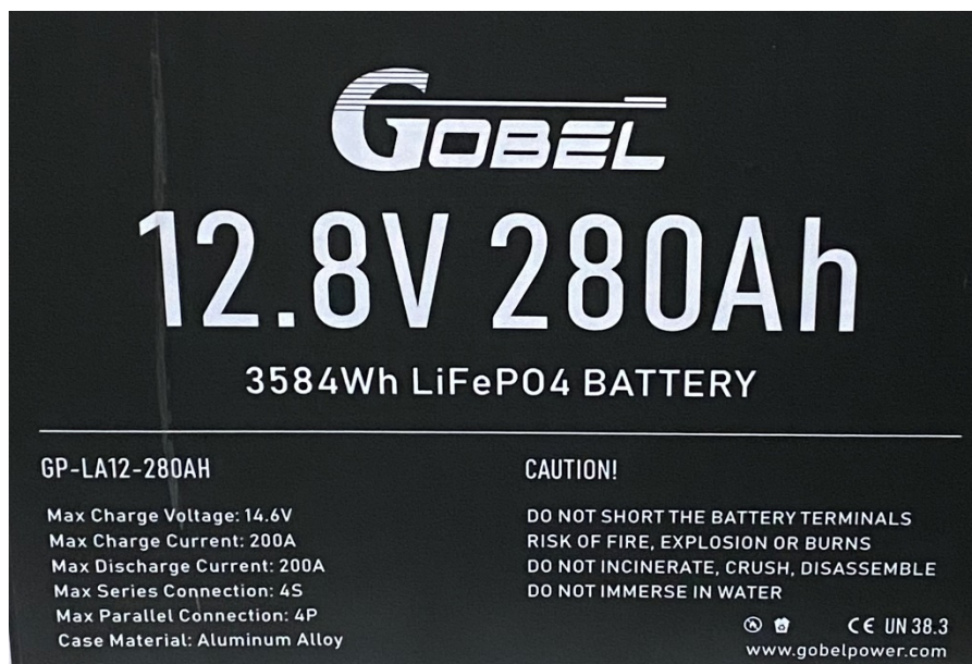
Picture 5. Label view