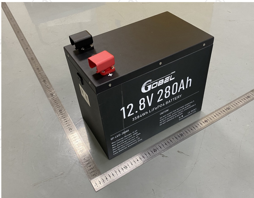
Picture 1. Front view of battery