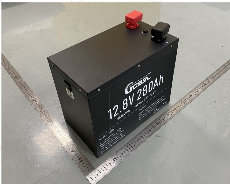
Picture 2. Back view of battery